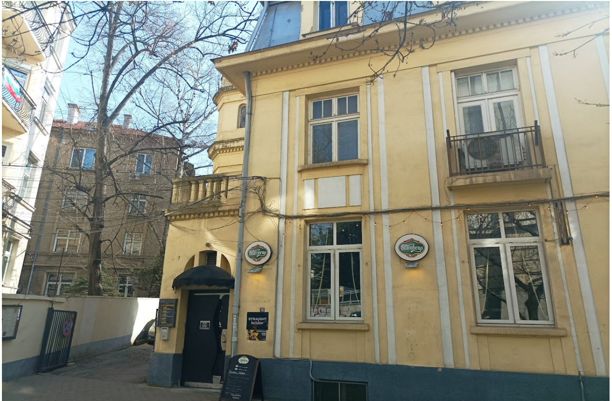
Place of the conference from hotel Cristal Palace: